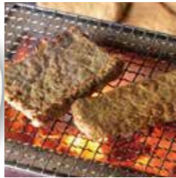
Jakoten Fried Fish Cake

Simple yet addicting comfort food from Imabari City.