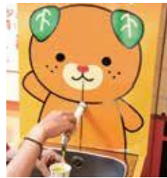
Orange Juice Faucet

A big hit with events and filming staff!