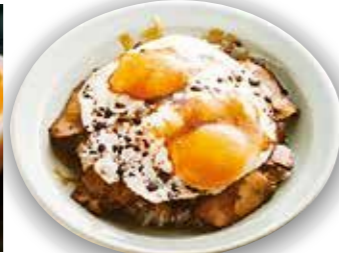
Imabari-style Grilled Pork and Egg on Rice

Whole mandarin orange wrapped in mochi for a juicy dessert.